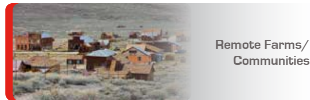
Remote Farms/ Communities

The IsatPhone 2 handset is easily inserted and removed by the press of a button on the top of the dock making it very easy to use away from the dock when required.