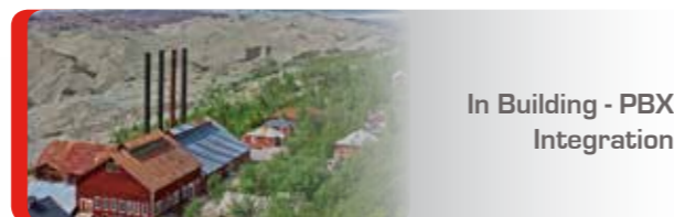
In Building - PBX Integration